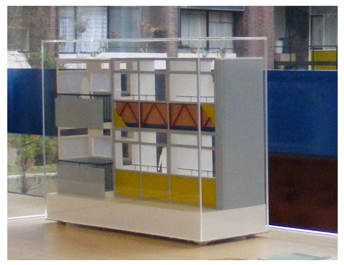
A 1:20 scale model of a typical proposed cladding module