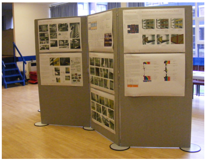
Drawings, diagrams and photographs to explain the proposals