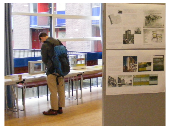
Samples of proprietary window systems and spandrel glass were available to view.